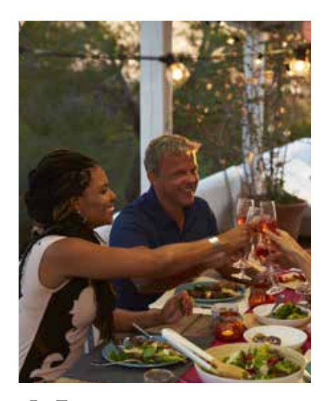
14 HOW HAS COVID-19 AFFECTED RETIREMENT PLANS? Attitudes and aspirations of this year's retirees