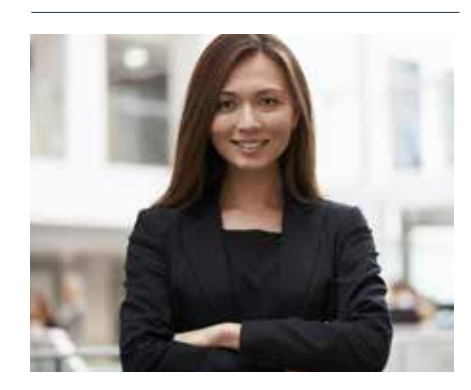
GENDER PENSION GAP British women impacted at every stage of career

16 PROPERTY WEALTH BOOST Older homeowners receive £1.94 billion